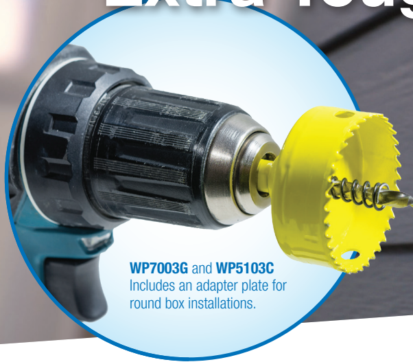
WP7003G and WP5103C Includes an adapter plate for round box installations.