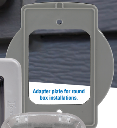
Adapter plate for round box installations.